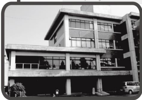
General Educational Building