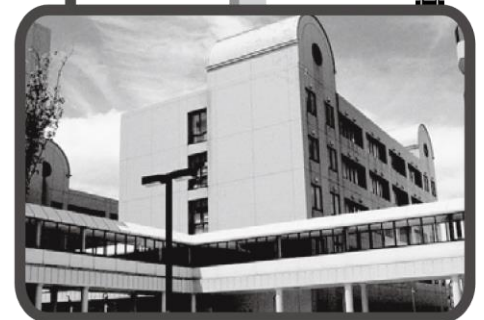
Life Sciences Building