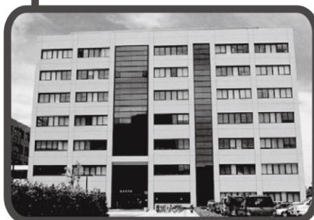
General Research Building